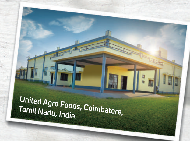
United Agro Foods, Coimbatore, Tamil Nadu, India.