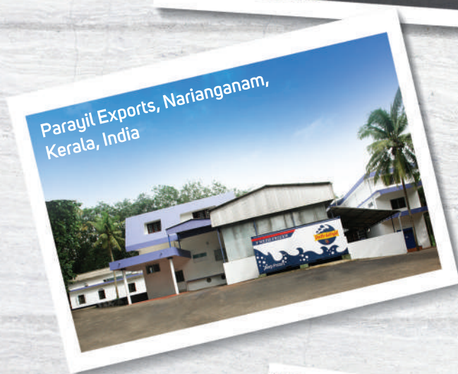
Parayil Exports, Narianganam, Kerala, India