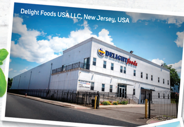
Delight Foods USA LLC, New Jersey, USA