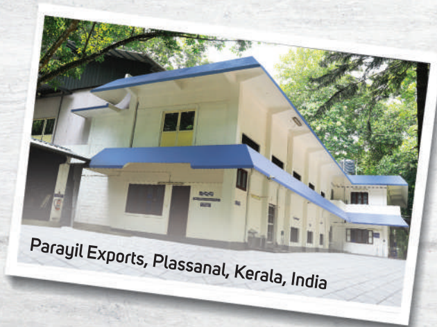
Parayil Exports, Plassanal, Kerala, India