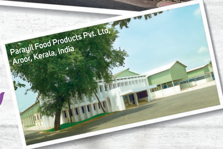
Parayil Food Products Pvt. Ltd, Aroor, Kerala, India