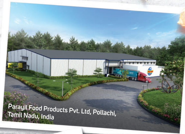
Parayil Food Products Pvt. Ltd, Pollachi, Tamil Nadu, India